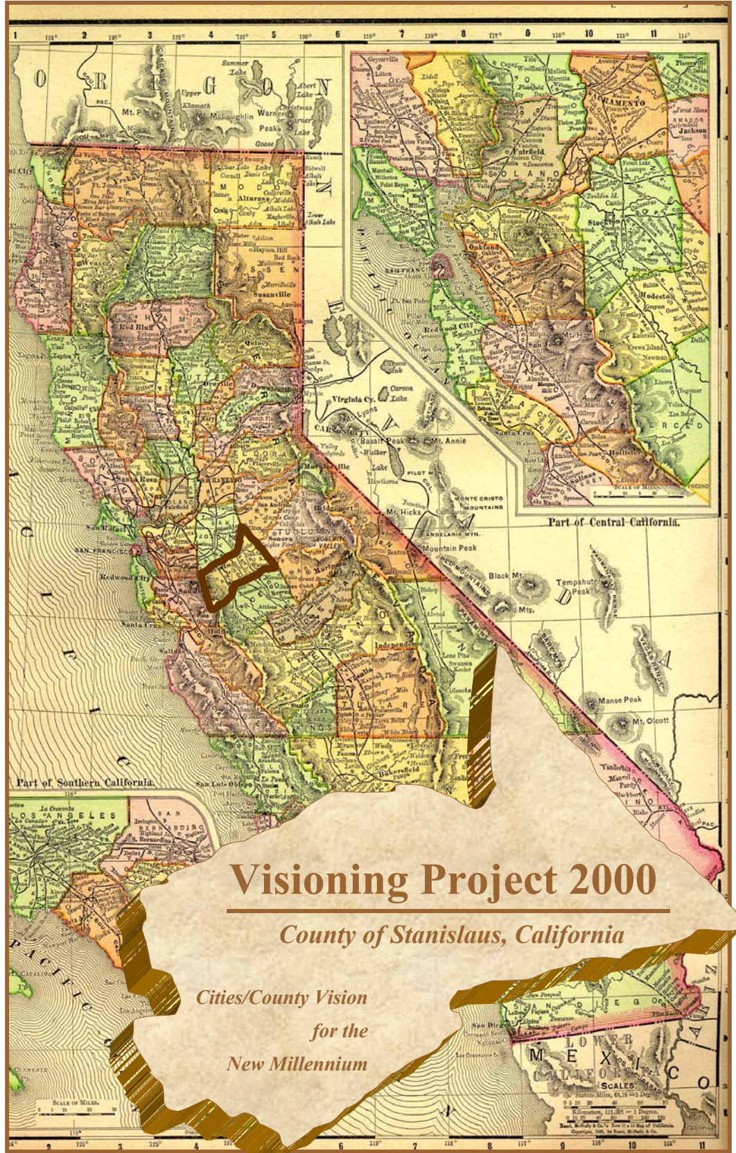
State of California: 1895